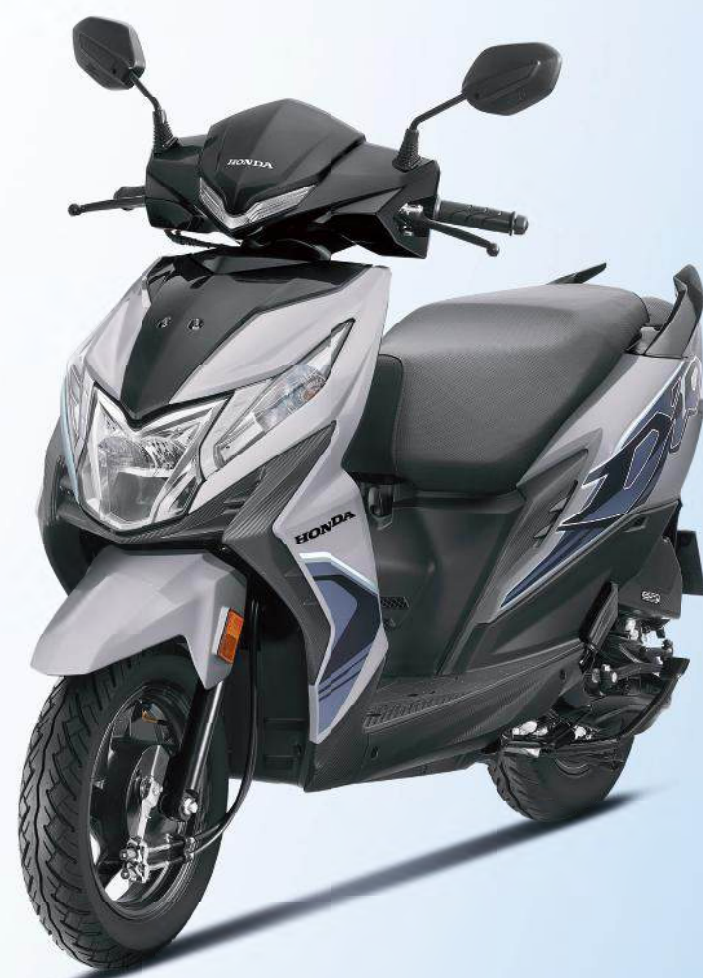
PEARL IGNEOUS BLACK + PEARL DEEP GROUND GRAY